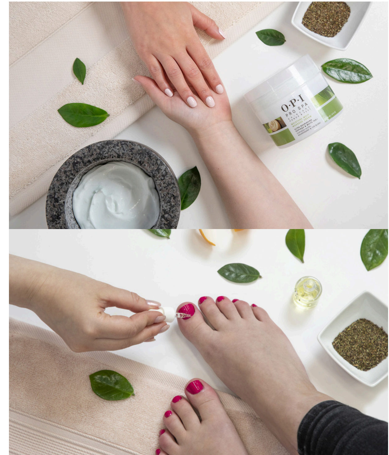
Option to have OPI Gel colour or OPI Infinite Shine Regular polish